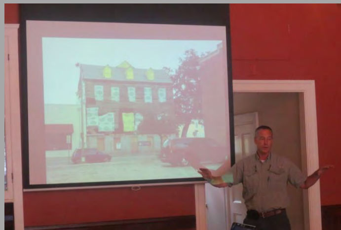
Engineer shows Historic Preservation class, the areas of restoration on the "Berrier House".