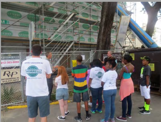
"Hands On History" summer camp, students get a first-hand view of the "Berrier House" restoration.