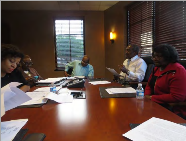
The Board at work.