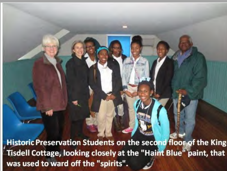
Historic Preservation Students on the second floor of the King-Tisdell Cottage, looking closely at the "Haint Blue" paint, that was used to ward off the "spirits".