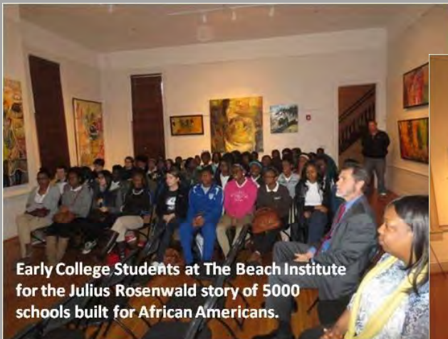
Early College Students at The Beach Institute for the Julius Rosenwald story of 5000 schools built for African Americans.

Each summer The Historic Savannah Foundation conducts a one-week camp for kids. It's called "Historic Preservation Class". It is a collaborative effort; so they have a number of partners. Elementary and Middle School students are recruited into this broad ranging and hands-on introduction to historic preservation.