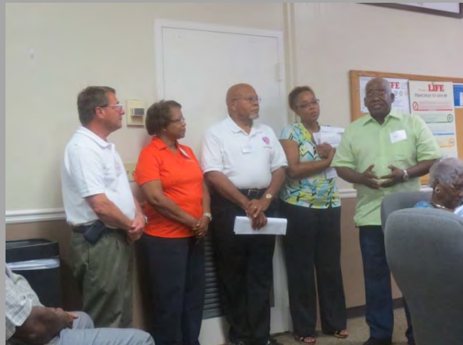
Board members receive grant from International Paper.