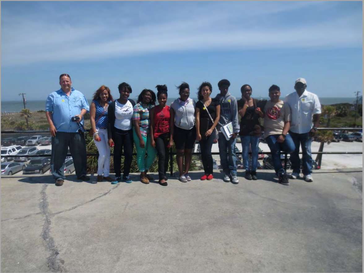
Historic Preservation Camp takes young folks on a field trip to the Tybee Lighthouse.